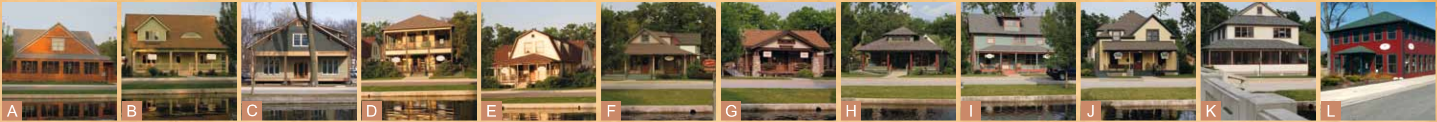
A. Cerulean 1101 East Canal • 574-269-1226

An exciting, yet intimate, setting for those seeking a memorable dining experience. Mediterranean, sushi... the best in contemporary cuisine.